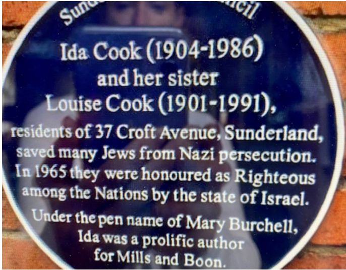
Recently installed plaque outside the sisters' childhood home in Sunderland.

Q: How did you learn about this true story?